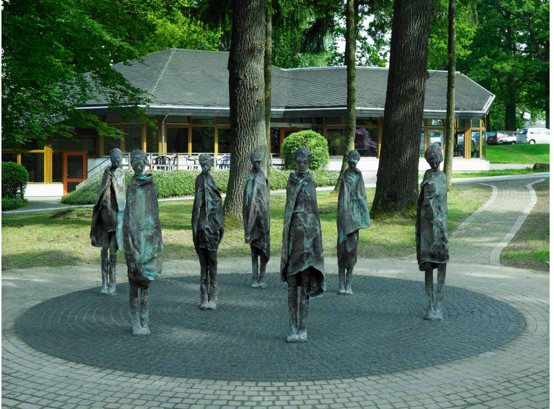
Ariane von Mauerstetten, Monads , 2008, patinated cast bronze 7-part installation, 168 x 380 x 380 cm, Evangelische Stiftung Tannenhof, Remscheid

Over the course of more than two decades, the sculptor and draughtswoman Ariane von Mauerstetten has created an oeuvre of roughly 2,500 works—one that reveals an artistic position now ripe for rediscovery and renewed critical attention. Her practice was deeply embedded in the art developments of the 1990s and 2000s.