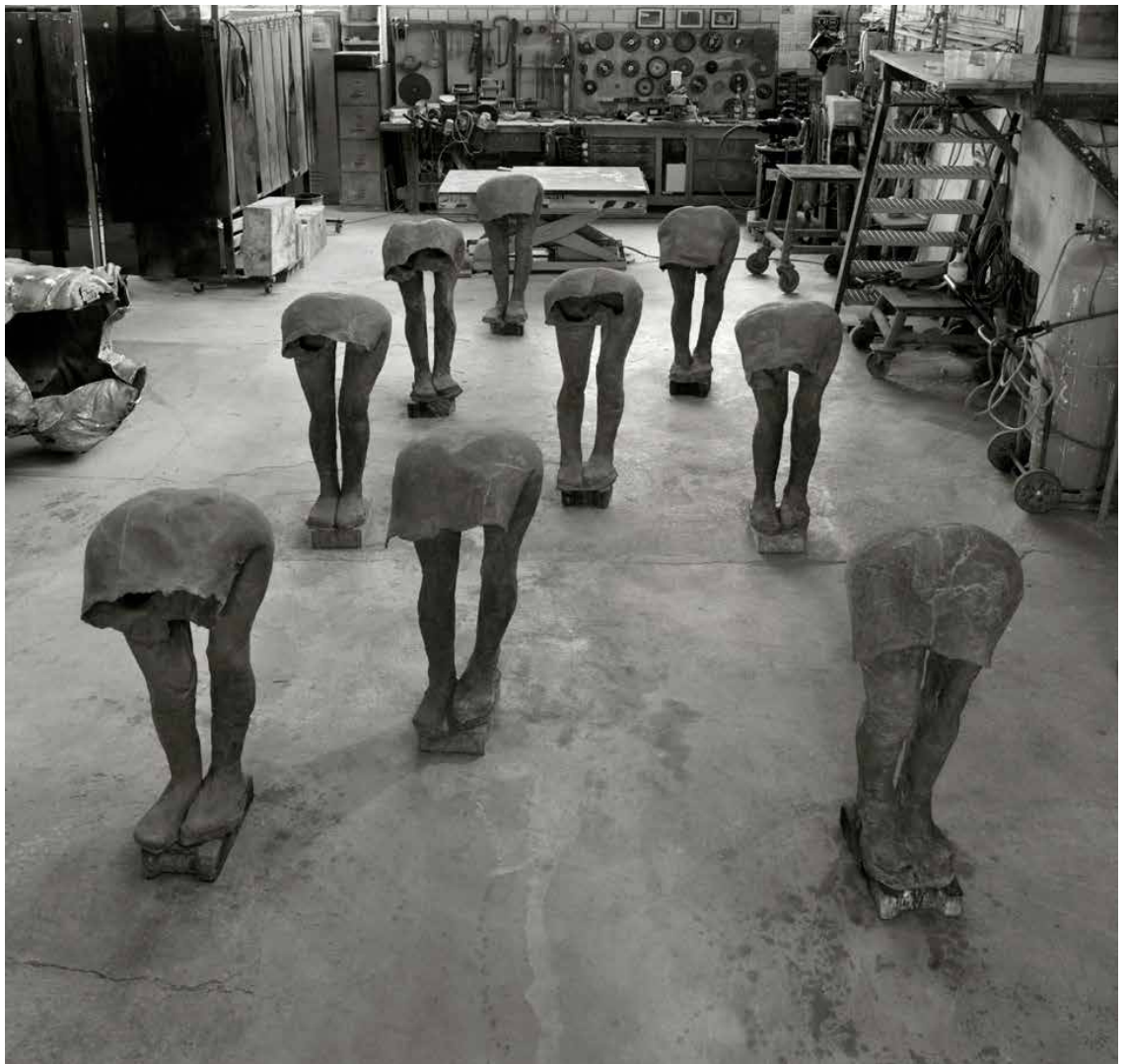
Ariane von Mauerstetten, Untitled (2005–2011), 2011, patinated cast bronze 9-part, sculpture: 95 x 280 x 240